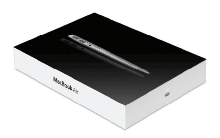
The 11-inch MacBook Air packaging is extremely material efficient, allowing at least 15 percent more units than the original MacBook Air to fit in each shipping container.

Lithium-ion polymer, 35 Whr; free of lead, cadmium, and mercury