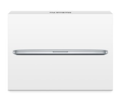
The retail and shipping box contains an average of 70 percent recycled content by weight.

The 13-inch MacBook Pro with Retina display features advanced battery chemistry that greatly extends the battery's lifespan. The built-in battery is designed to deliver up to 1000 full charge and discharge cycles before it reaches 80 percent of its original capacity. In addition, Adaptive Charging reduces the wear and tear on the battery, giving it a lifespan of up to five years.