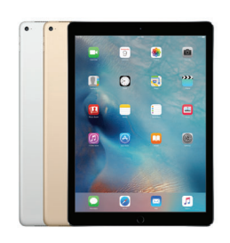
Date introduced September 9, 2015