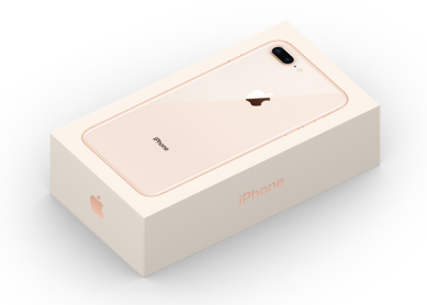
U.S. retail packaging of iPhone 8 Plus contains 81 percent less plastic than iPhone 6s Plus packaging and contains 52 percent recycled content.